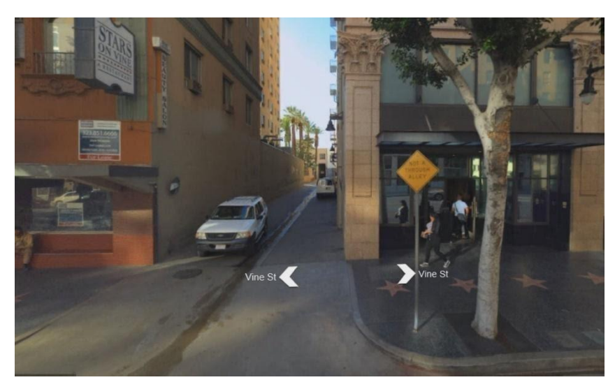
Figure 2 Street view of only vehicle access point